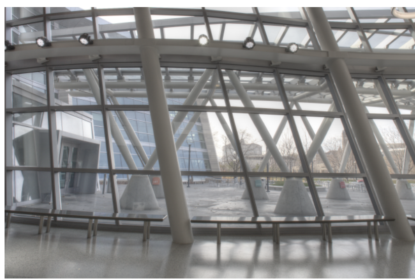
Salt Lake City Public Safety . GSBS Architects