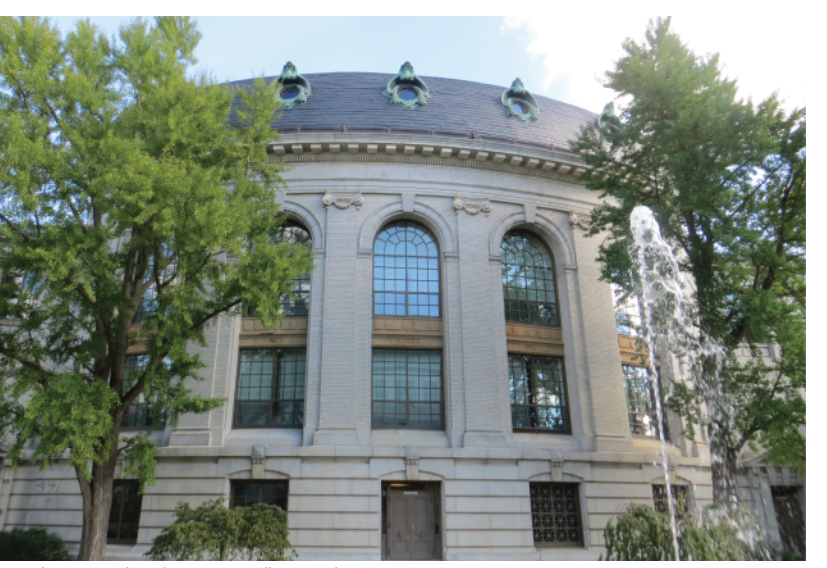
United States Naval Academy-Maury Hall . Ernest Flagg

Experienced project managers assigned to every project, from bidding through installation